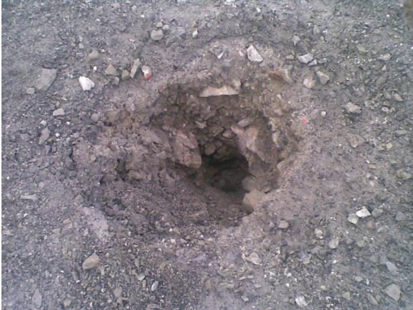
An assessment should be made whether blocked holes, with broken ground at the collar, are suitable to load

An assessment is to be made in the event of broken ground at the collar, reduced free-face burdens, excessive toe burdens, or reduced stand-off from broken ground, as to whether adjusted stem heights, primer locations and charge quantities are required.