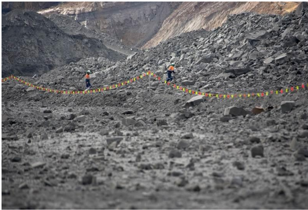
Post-blast inspection must be completed by the Shotfirer(s), prior to re-entry by other personnel.

(a) The Shotfirer has confirmed that all explosives have detonated, that no misfires are evident, and that the shot has fired satisfactorily;