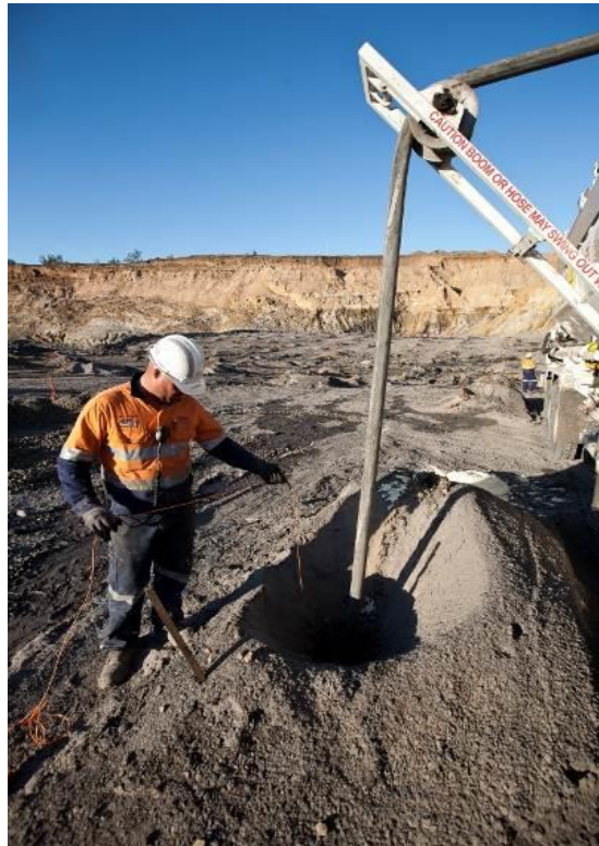
Make sure that primers do not 'float' when delivering pumped explosives