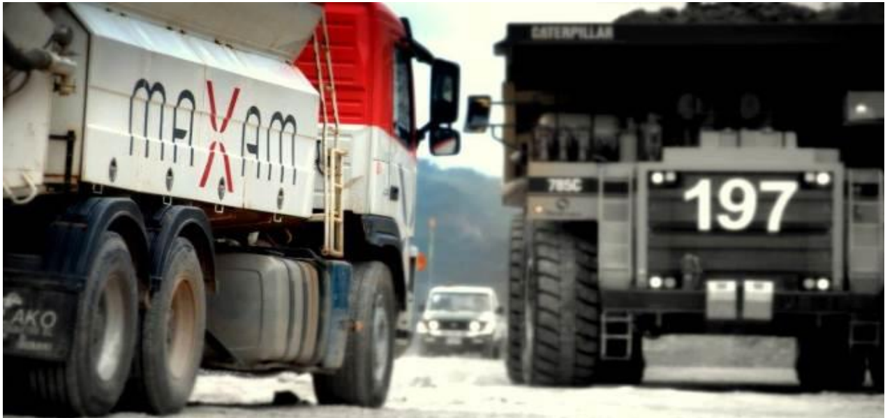
Interaction of MPU's with active haul routes must be risk assessed

(c) Priming, charging and stemming blastholes – Avoiding hazards associated with the snap/slap/shoot of signal tube downlines, unplanned detonation in elevated temperature and/or reactive ground, and flyrock/overpressure associated with overloaded or under-burdened holes;