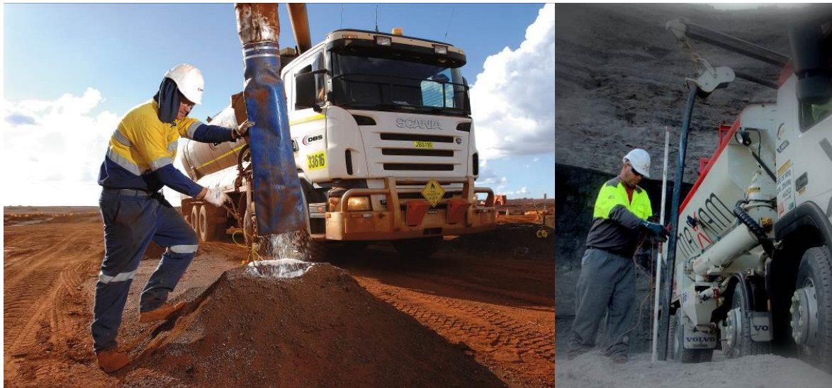
Check column rise during charging using a bobbing tape or dip stick, to ensure that blastholes are not over or under loaded outside accepted tolerances

(a) Check column rise during charging using a bobbing tape or dip stick, to ensure that blastholes are not over (or under) loaded outside acceptable tolerances for the blast. Delivered charge mass and measured deck length will usually be close to expected values, based on bulk explosive density and the nominal blasthole diameter, otherwise additional checks will need to be made;