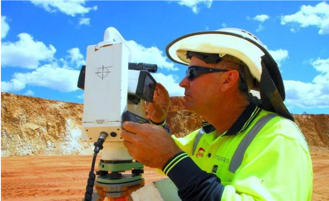
Face profiling and blasthole tracking systems may be required to assess variable free face burdens