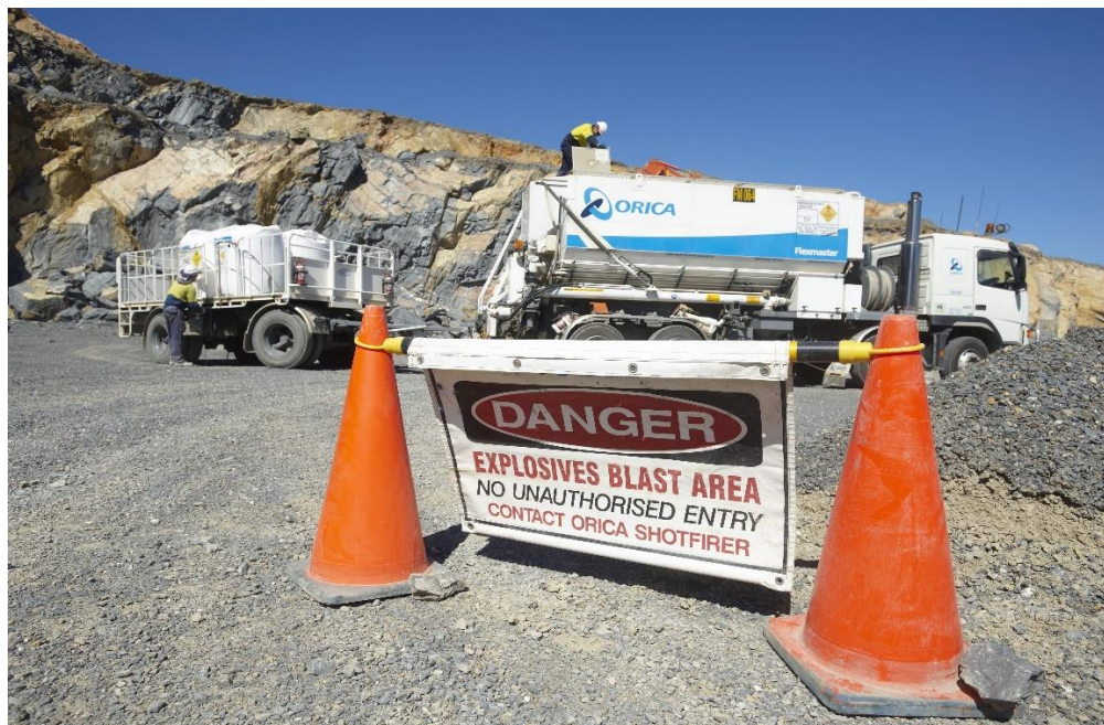
Typical examples of Clear signage to indicate a blast area and blast exclusion zone is an essential part of the demarcation process