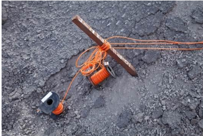
Downlines should be secured at the blasthole collar

(c) The required number of boosters and downlines should be available for the shift, and laid out at the blasthole collars as required, with a peg (or other suitable retention device) to secure the downline at the collar;