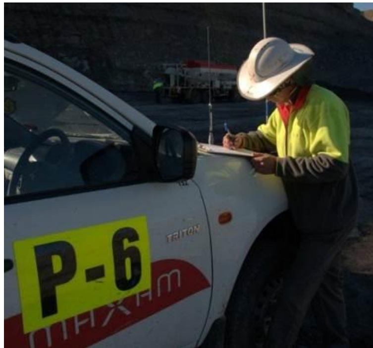
All relevant information regarding the blast should be maintained as part of the blast management system